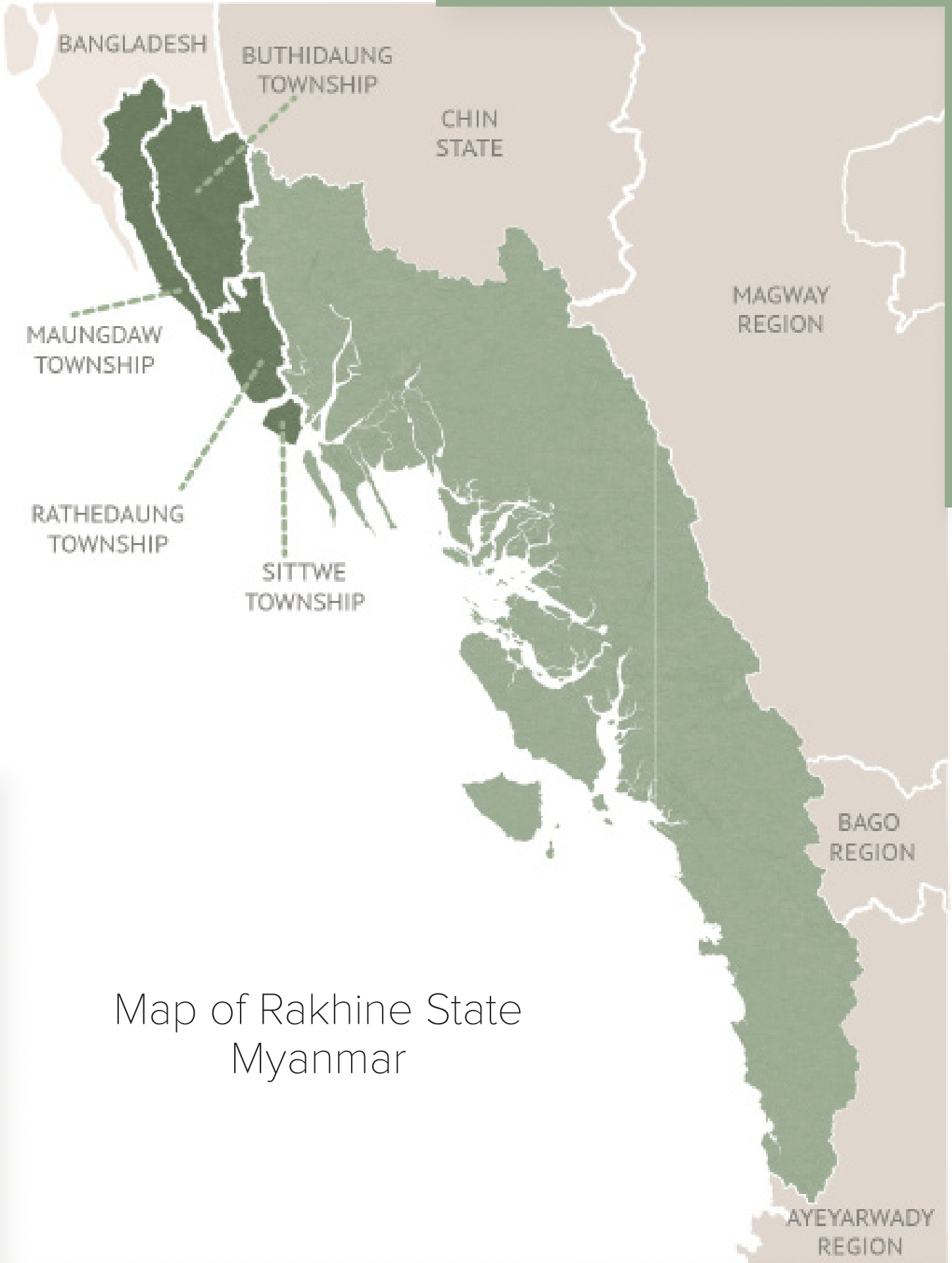
Map of Rakhine State Myanmar