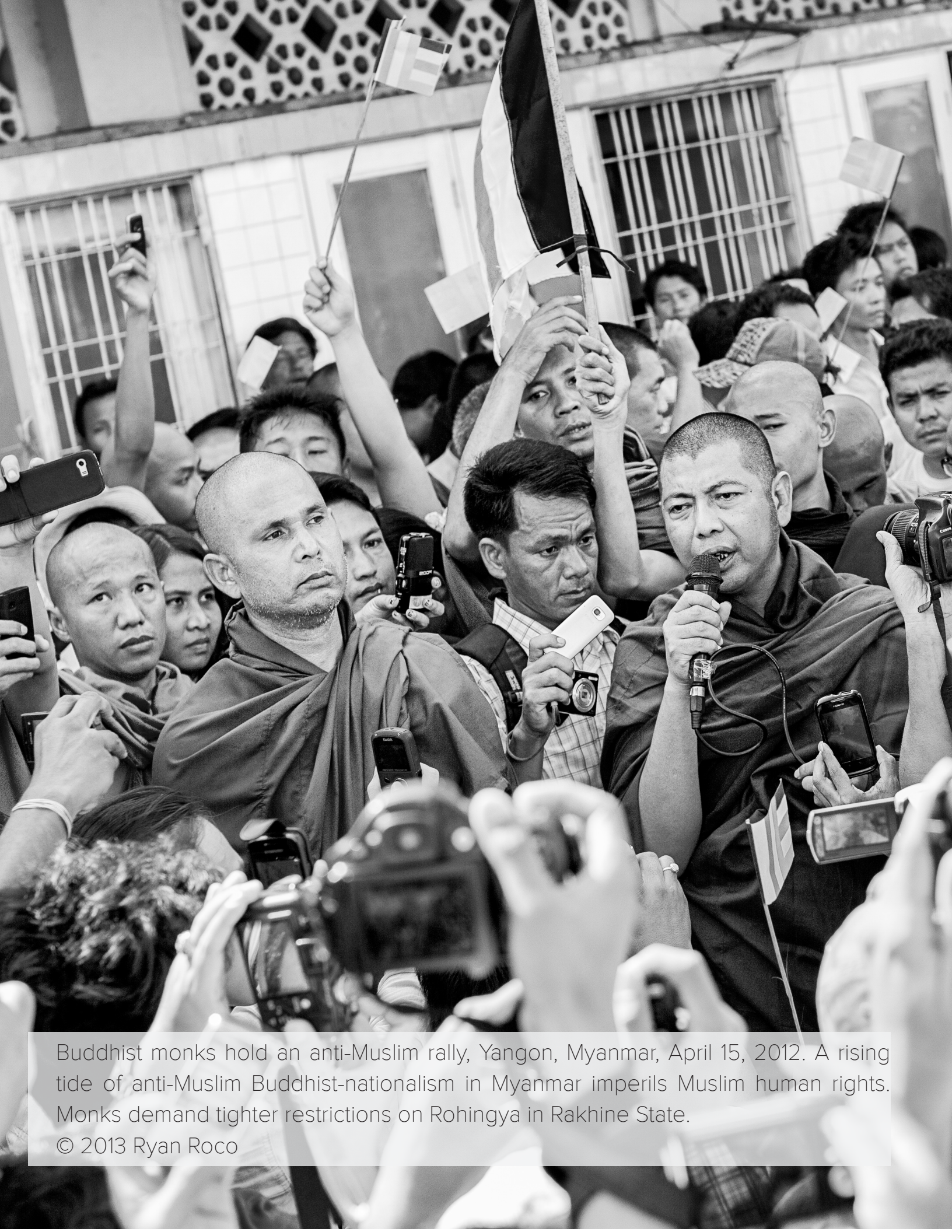
Buddhist monks hold an anti-Muslim rally, Yangon, Myanmar, April 15, 2012. A rising tide of anti-Muslim Buddhist-nationalism in Myanmar imperils Muslim human rights. Monks demand tighter restrictions on Rohingya in Rakhine State.