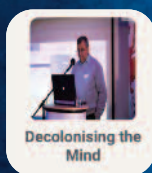
Decolonising the Mind