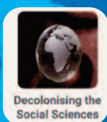
Decolonising the Social Sciences