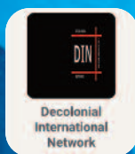
Decolonial International Network